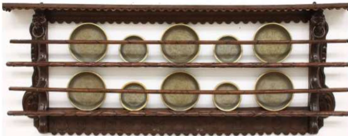
PLATE RACK MATCH SUNDAY, OCT. 1