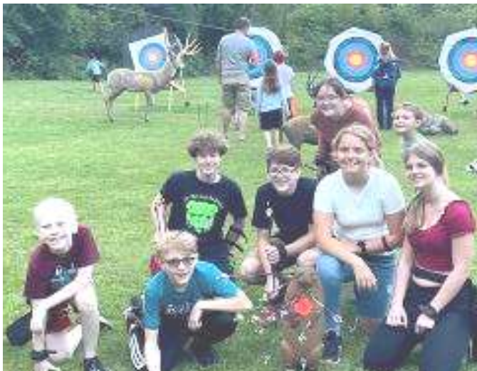
Plaid & Khaki